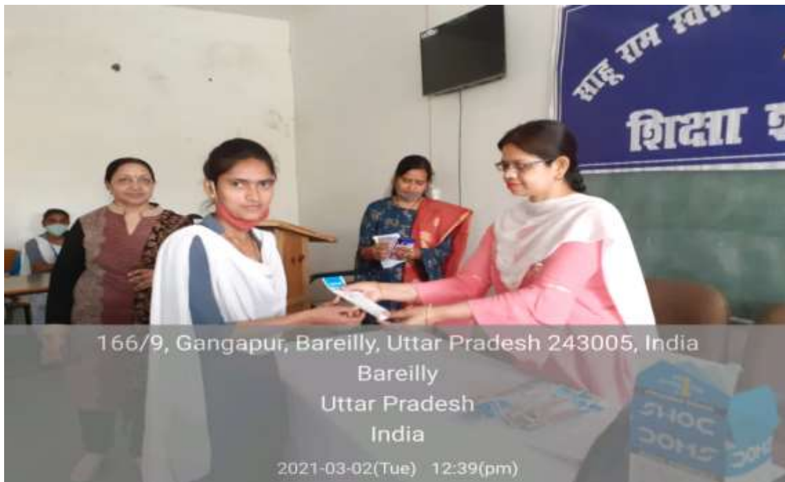
166/9, Gangapur, Bareilly, Uttar Pradesh 243005, India Bareilly Uttar Pradesh India