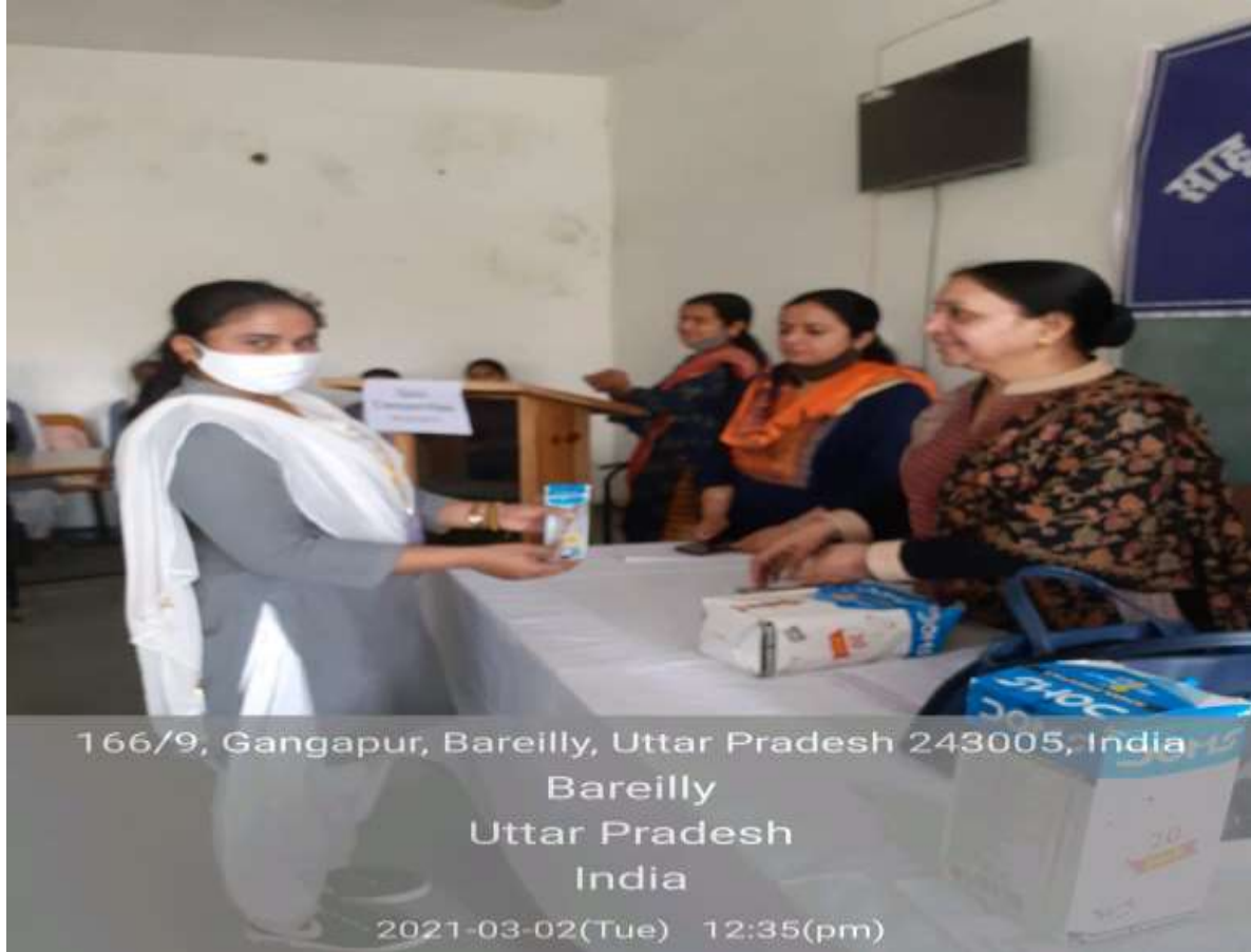
166/9, Gangapur, Bareilly, Uttar Pradesh 243005, India Bareilly Uttar Pradesh India